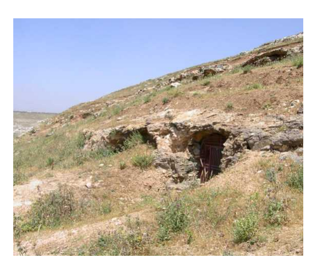
Entrance to the Tombs