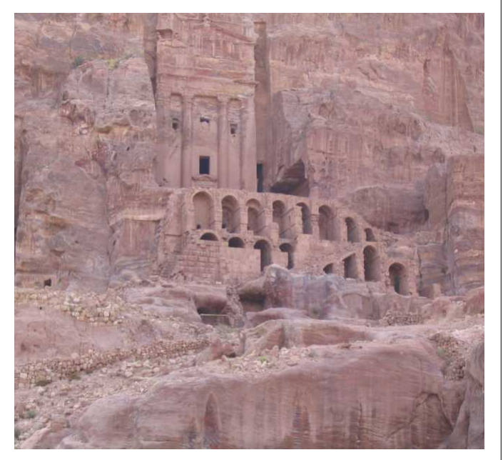
A Petra Scene

The Jordanian hospitality was of a high standard: we were put up in a well appointed hotel located right next to the entrance of Petra and all our meals were provided, both at the hotel itself and at the local venues.