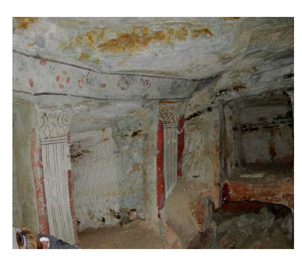
One of the Tombs