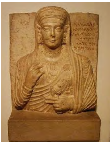
An Australian Connection Page 6

So what should NATO have done if Gaddafi had stored weapons in the ruins of Lepcis Magna? Should its response to the situation have been different to what its response would have been if the site were not of cultural importance to the West, or should it have been governed purely by the tactical demands of its military operations in Libya? Ostensibly, NATO's bombing of Libya was to enable Libyans to enjoy the benefits of Western political values—would the achievement of that objective have made Lepcis Magna dispensable? Perhaps it would have, but where the achievement of the objective cannot be guaranteed, would we have Lepcis Magna, like the Parthenon, lost in vain?