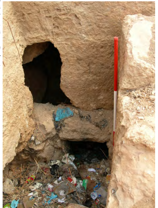
Welcome to our world of tomb exploration.