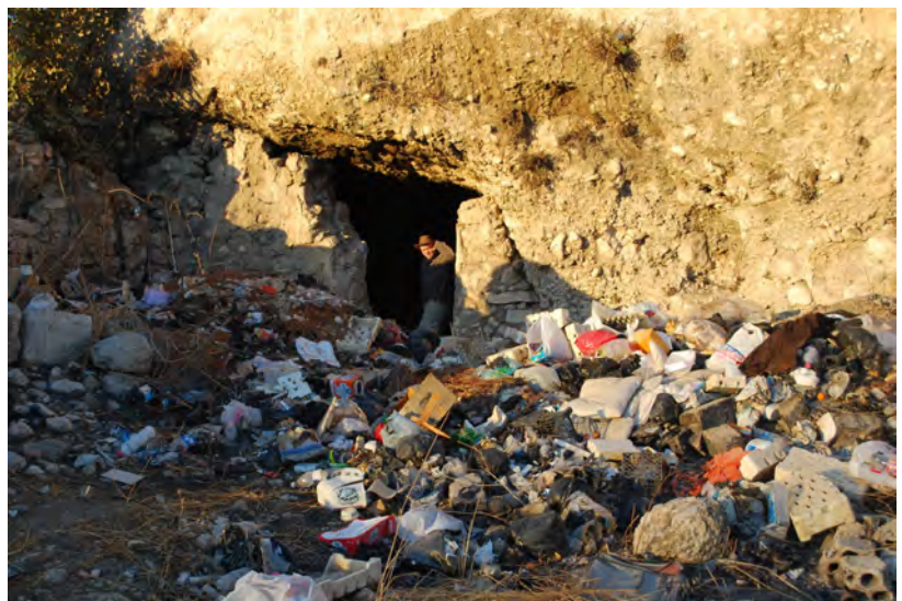
Andrew Card successfully gaining access to a tomb across a field of festering rubbish

First drama of the season over, we set about our work in earnest setting off at the crack of dawn each day laden with our survey kit essentials, assorted headgear and potions, enough water to sink a battleship and of course the essential snake scaring, scorpion poking, wild dog defending, measuring and walking aids a.k.a ranging rods. Over three seasons the team has covered urban and rural terrain, forest and fields, descended precipitous slopes into wadis, struggled up hills, hacked through vegetation, sighed at yet another quarry (only 220 or so of those) and squeezed, wriggled and crawled into numerous tombs. Survey routes were planned with military precision around the