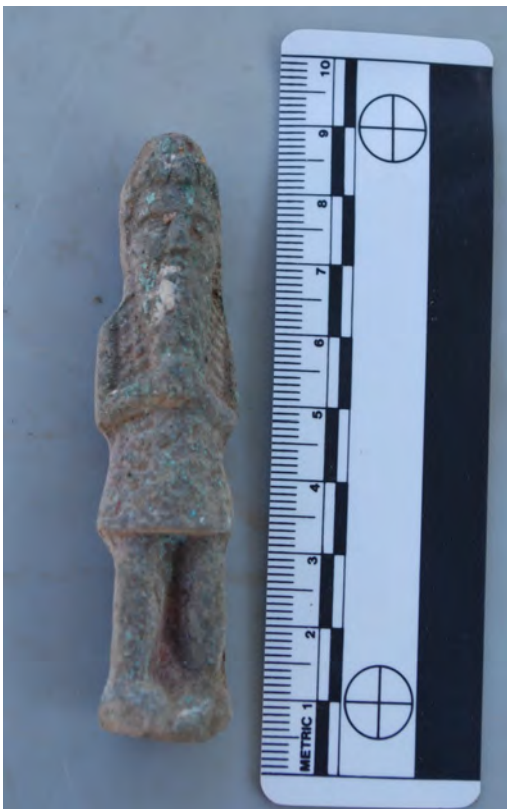
The fake Assyrian deity found in an artefact scatter in a ploughed field.