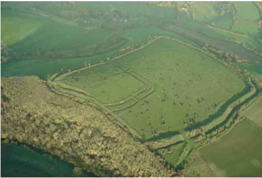
Hod Hill looking north-east.