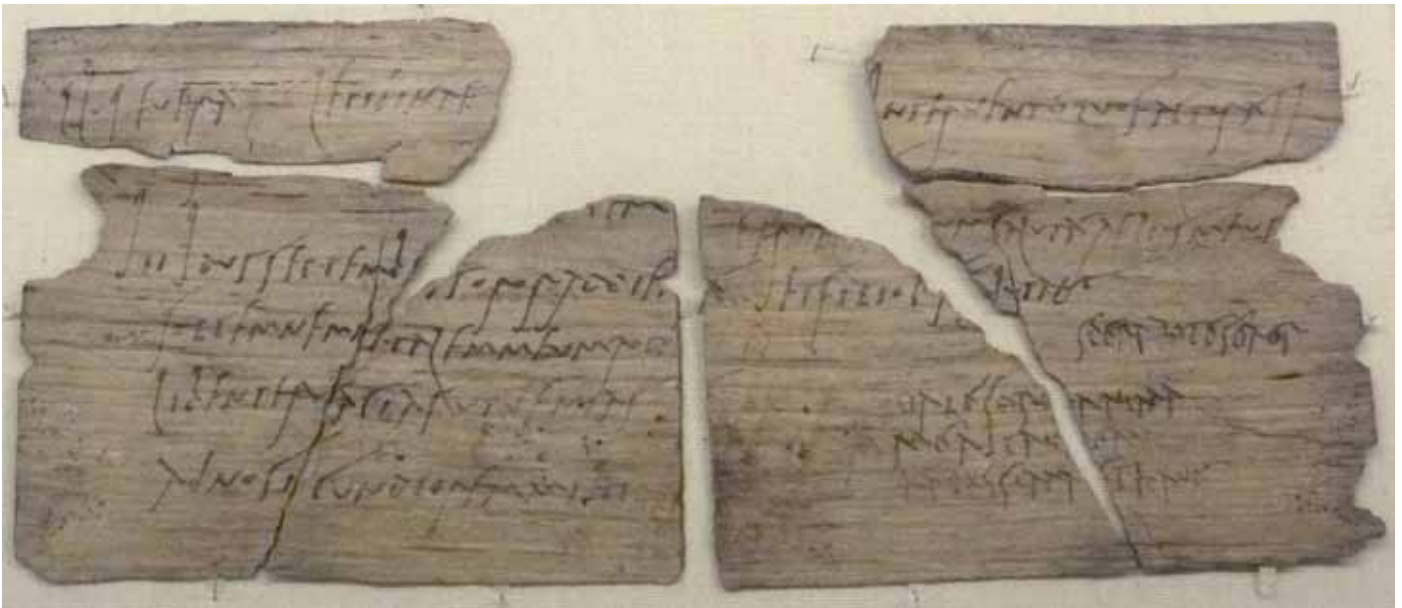
Vindolanda Tablet 291: Claudia Severa, wife of Flavius Cerialis, inviting her friend to her birthday party. “...a warm invitation to make sure that you come to us...the day will be more enjoyable for me if you are present...”

tablets discovered, due to the names mentioned at the end of the letter. Another tablet deals with the knotty issue of the number of wagons required to transport stone.