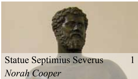
Statue Septimius Severus 1 Norah Cooper