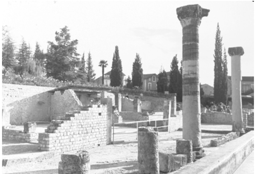
Maison de Messil, Vaison-la-Romaine, 1972.

I've no doubt that the reason the Roman bridge at Vaison-la-Romaine is so well preserved today is because it still serves its original purpose very well. Other ruins however rely on the passion and commitment of organizations like RAG to raise their profile and keep alive our interest.