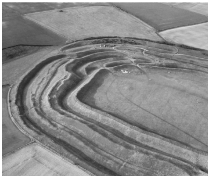
Maiden Castle western entrance from south-east.

At the eastern entrance of Maiden Castle