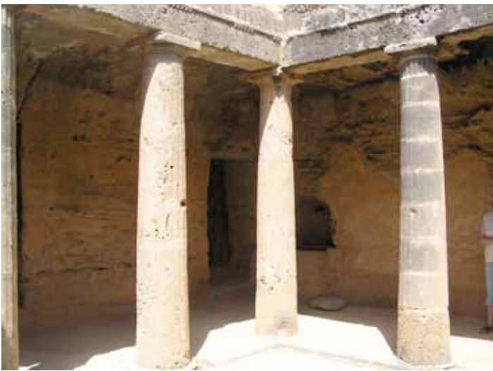
Tomb of Kings.