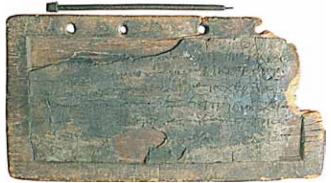
Left: Mural from Pompeii of woman with stylus and tablet, thought to depict Sappho. Museo Archeologico Nazionale, Naples, Italy.