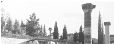
Vaison-la-Romaine, 1972 6 Penny O'Connor