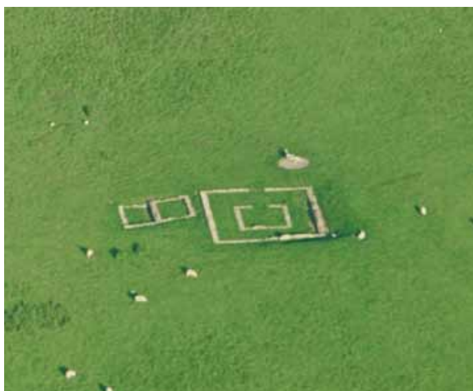
Roman-British temple inside Maiden Castle.