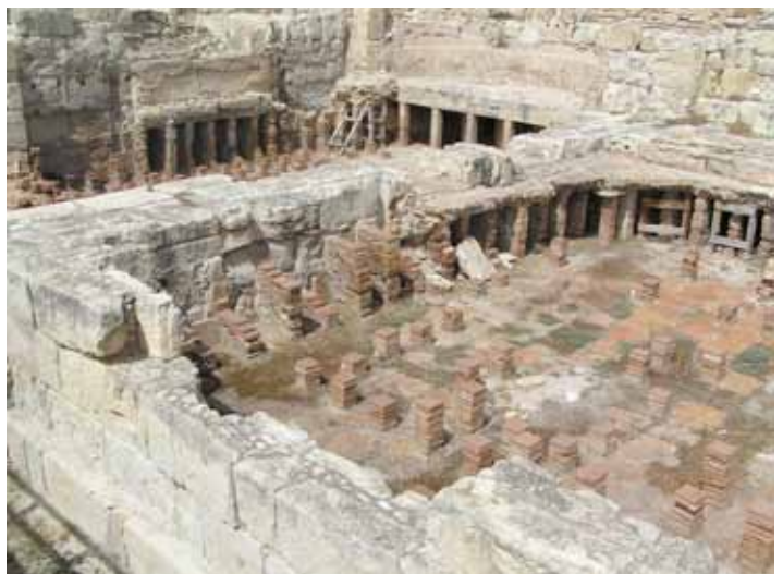
Public Baths, Kourion.