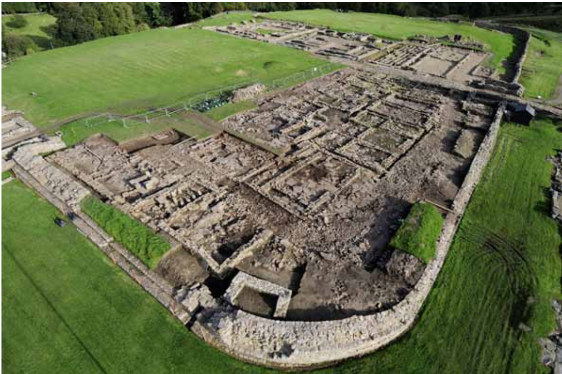
Vindolanda Roman Fort.

old ramparts, creating a substantial settlement. Yet another phase of construction, in the early third century, enlarged both the fort and its civil settlement, confirming the military importance of Vindolanda's position as a frontier crossing post. Archaeological evidence now verifies that Vindolanda was inhabited for over three hundred years.