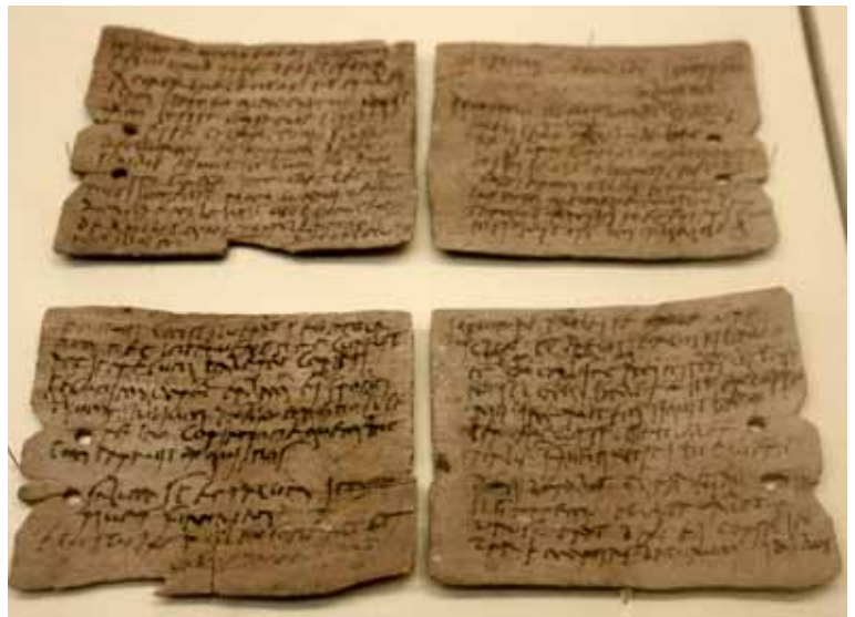
Vindolanda Tablet 343.