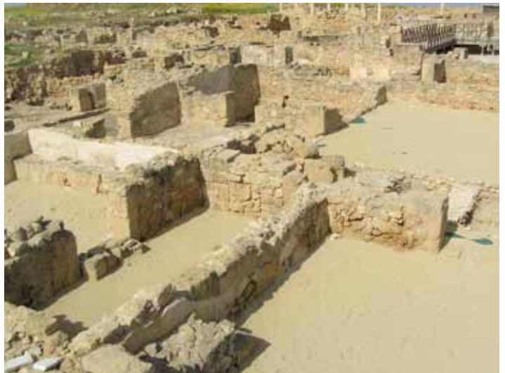
Paphos Ruins.