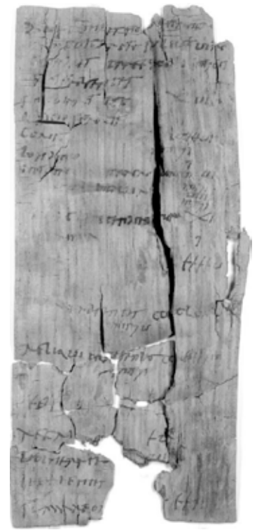
Left: Reconstruction of Vindolanda Fort; Right: Vindolanda Tablet 154: Cohort strength report.

compared with the painstaking preparation of parchment, especially in isolated settlements. Unfortunately, once the wax decomposed, the etched words may well have perished along with it, as it would be unlikely that the stylus would mark the wood underneath. There were about 180 tablets, fashioned in this way, discovered at Vindolanda, along with numerous styli.