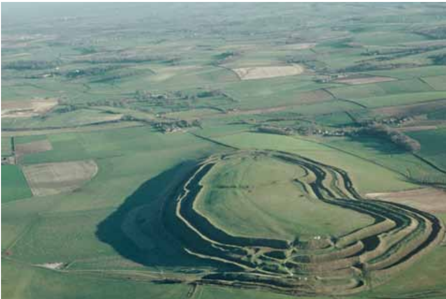
Maiden Castle from the west.

Roman fort in freshly ploughed soil. Soil marks show clearly the street system, the main range of buildings and outline of building plots. This photo was probably seen by Professor Ian Richmond who, between 1951 and 1958, carried out a series of excavations in the Roman fort on behalf of the British Museum. From the wealth of information derived from these extensive excavations and from the finds, it is believed that one of the cohorts of Legio II , about 600 men and an auxiliary cavalry unit of about 250 men were stationed in this fort. There was also evidence that the Roman conquest of the fort was successful due to artillery fire, especially concentrated on the area of what could have been a chieftain's hut. The main buildings excavated were: the Principia or Headquarters, the houses of the Legionary Centurion and Cavalry Commander, the barracks, a hospital and other minor buildings. None of these buildings are discernible today, not even from the air.