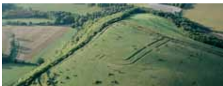
Hillforts in Dorset 3