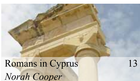
Romans in Cyprus 13 Norah Cooper