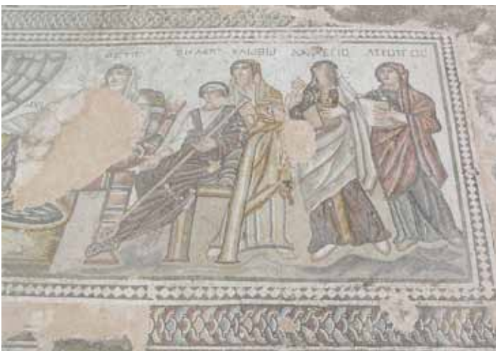
Mosaic at Paphos.