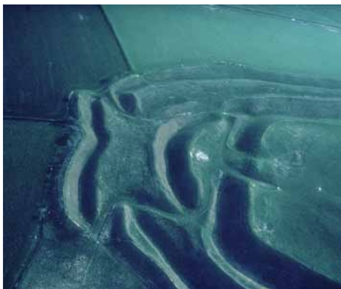
Maiden Castle eastern entrance from northwest.