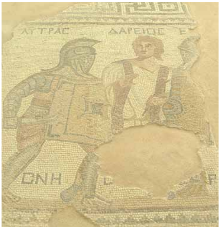
Gladiator's house, Kourion.