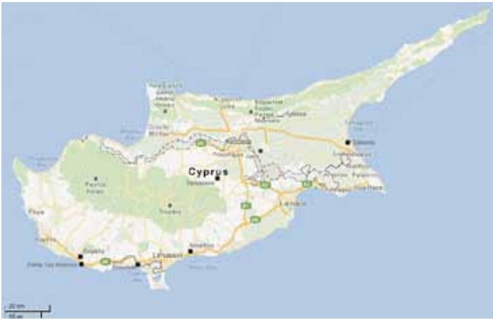
Map of Cyprus (Murray Jones).